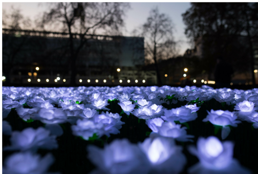
'Ever After Garden', Grosvenor Square.

'Borealis' is in turn part of 'Winter Lights', a citywide celebration of illumination, and part of Mayor Sadiq's domestic tourism drive, Let's Do London.